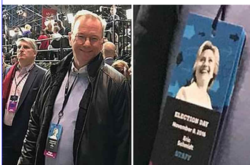
Figure 1: ERIC SCHMIDT RAN GOOGLE'S ELECTION RIGGING

Google executives and Democrats have disputed Epstein's findings, apparently unaware that we can simply google documented instances of the Silicon Valley search giant's overt bias surrounding elections, their ability to