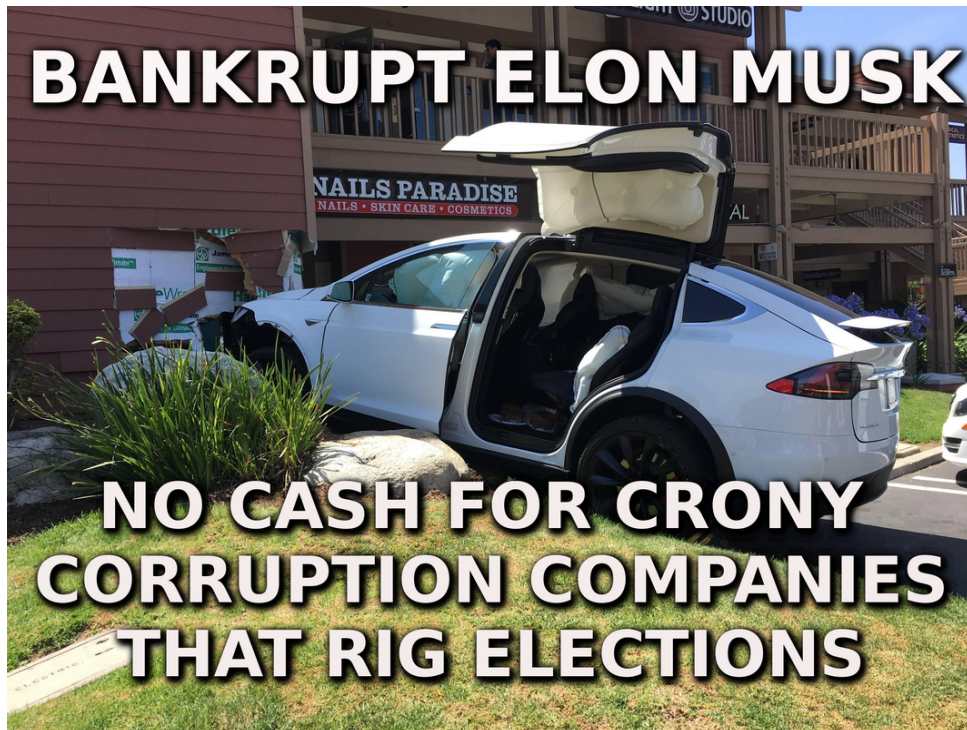
Tesla's out-of-control sudden-acceleration surge defects and exploding batteries are not as bad as Tesla's out-of-control corruption and bribery.